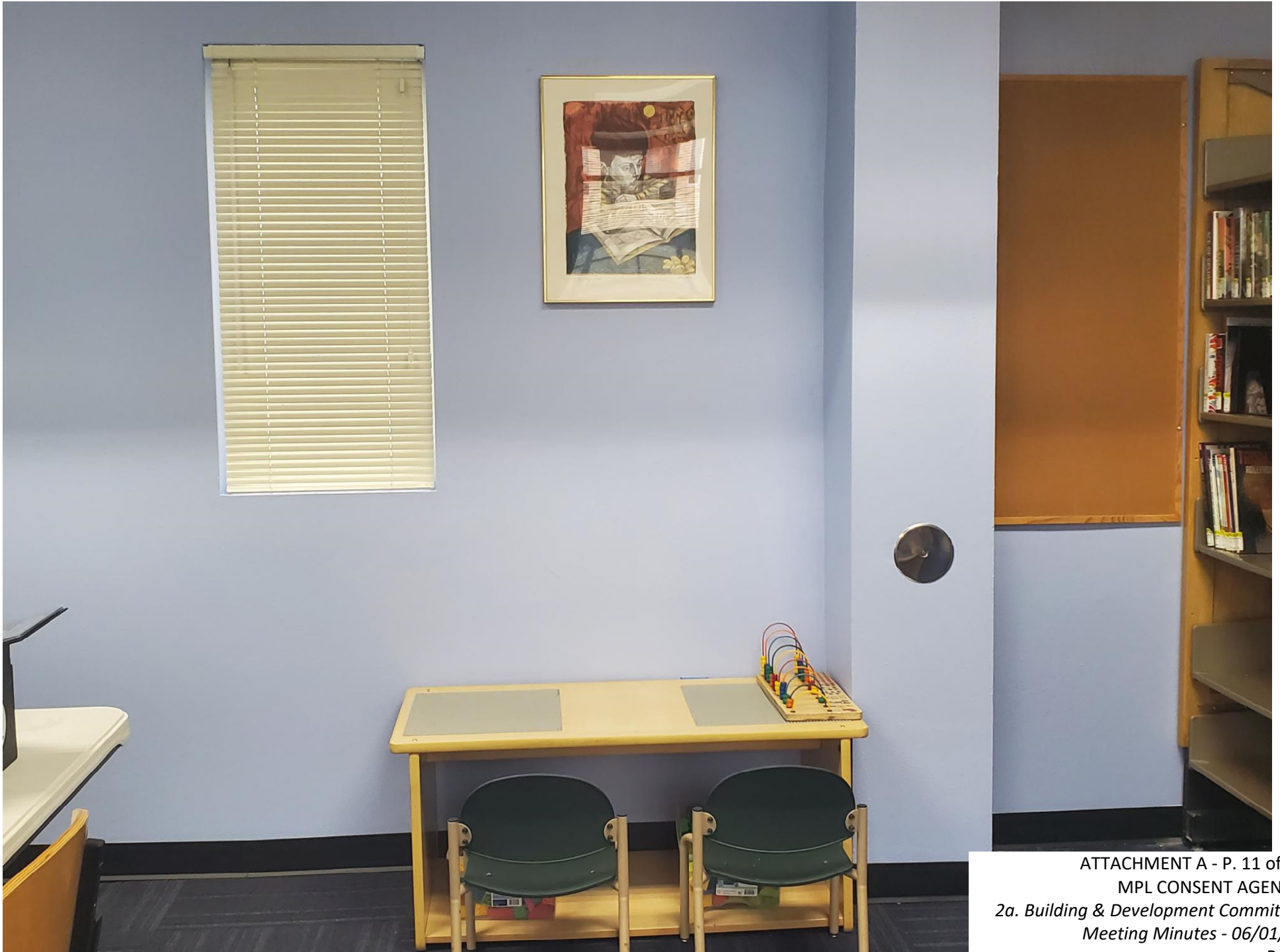
ATTACHMENT A - P. 11 of 22 MPL CONSENT AGENDA 2a. Building & Development Committee Meeting Minutes - 06/01/23 P. 13